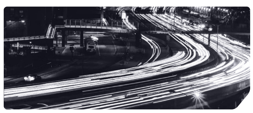
ADVOCATING FOR EFFICIENT TRANSPORTATION