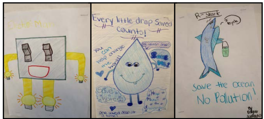
Students at Franklin Elementary involved the whole school in their energy efforts through a poster competition to develop a cartoon mascot to promote energy saving efforts.

Franklin Elementary’s PowerSave Team came up with a secret weapon to increase efficiency: FUN. They held a mascot contest, asking kids to create their own energy-saving heroes. Winners of the contest were chosen by the students, and they were then featured on posters for the program. They’re planning to use these characters in cartoons that will go home to parents.