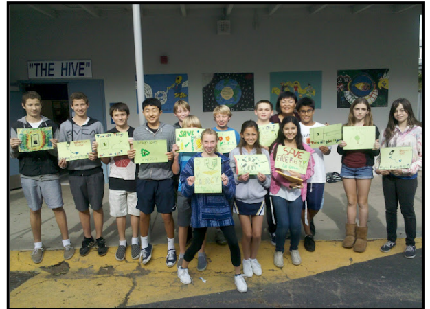
To compile their data and share online, the Ensign Energy Patrol (pictured here) designed their very own website.

The Ensign Energy Patrol knows there's something to being tech savvy! This year, the 7th grade Energy Patrol designed their very own website to spread the savings message to the student body. The site is student designed and managed, and includes information about activities, savings successes, and announcements with easy energy savings tips. Students asked visitors to take the short energy efficiency pledge, reaching 500 participants. Find their website at www.ensignenergypatrol.webs.com .