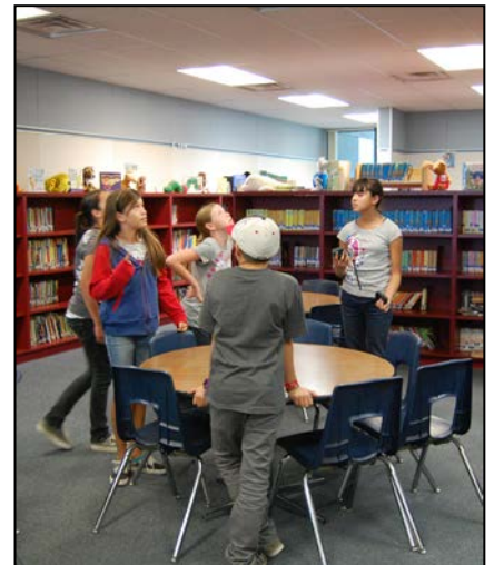
An Immediate Energy-Saving Plan demands focus on a schools largest energy hogs. Highland Elementary hit the mark with their focus on lighting.