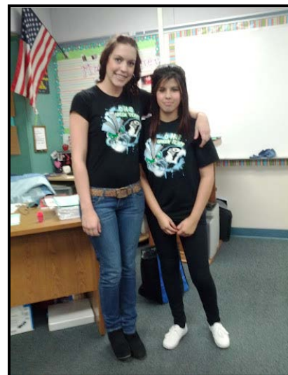
Students on Ortega High School's PowerSave Team pose for a shot with their team t-shirts designed by the students themselves.

El Cerrito Middle School integrated the PowerSave Schools lessons into classes to inform students about the connection between energy and the environment. Using the Road Map Guide lesson "Changing Our Ways" to educate students about how much energy is used to produce items in our everyday lives, all 7 th grade Life Management classes identified ways to better manage their energy use. Students then strategized ways to save energy, including recycling materials