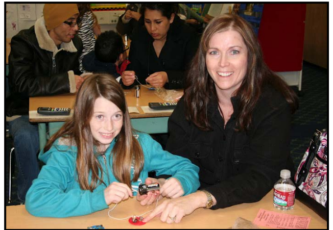
Students at Garretson Elementary School made electrical circuits at family Science Night as part of a lesson on energy.

After using the original data collection forms provided by the program, Eisenhower Elementary's PowerSave Team decided to design their own for charting the particular behavior changes they were seeking to instill. The PowerSave teaching team created new templates that helped students monitor which classrooms were using half-lighting, turning off lights when unoccupied, and shutting computers down at the end of the day. They