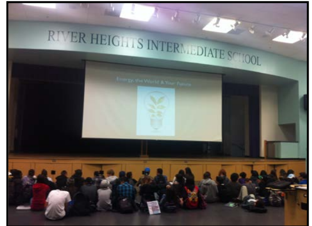
At River Heights Elementary, the PowerSave Local Project Leader gave a presentation on green careers and students prepared questions about how they could make their own dream jobs greener.

River Heights Intermediate took advantage of Career Week to give their PowerSave Local Project Leader a chance to talk about his own path to a green career. He spoke about his work as an author, and how the experience of writing a book about seal made him appreciate the impact of our energy use on the natural world. After describing the scope of our energy challenges, he introduced students to a broad range of career opportunities in green energy, and the educational pathways that could lead them there. Students prepared questions, focusing in particular on the ways in which they could make their own dream jobs a little greener.