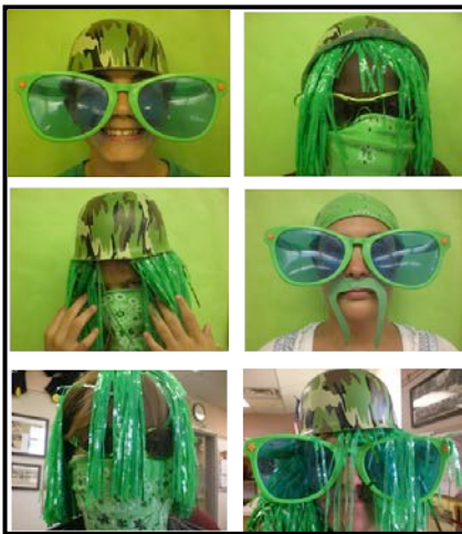
Sierra Vista's PowerSave Team posted these funny, ambiguous photos around school to build suspense before introducing the PowerSave program via a video broadcast.