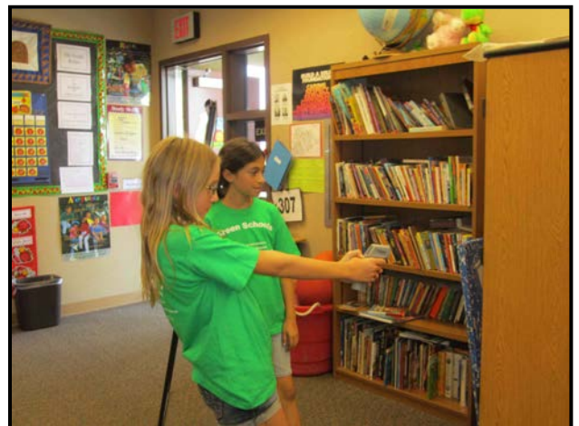
As Eisenhower Elementary collected data during their energy audits (pictured above), the team used their own custom data sheets to collect information such as which classrooms were using half-lighting a shutting down computers at the end of the day.