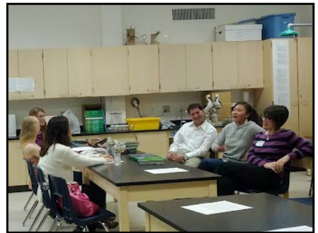
Alumni from the Alliance to Save Energy's PowerSave Green Campus Program at UC and CSU Universities visited Corona del Mar High School to discuss their path to green careers, including lessons about their college educations.

Three PowerSave Green Campus alumni, graduates of the university version of the PowerSave Schools program, presented to 90 AP Environmental Science students at Corona del Mar High School to share tips and tricks to get a job in the energy/environmental industry. Panelists talked about their profession and their career path, but also shared valuable lessons about college life. Students learned the keys to success post college are to obtain work experience through an internship/volunteer position, to do what you're most passionate about, and network with potential employers.