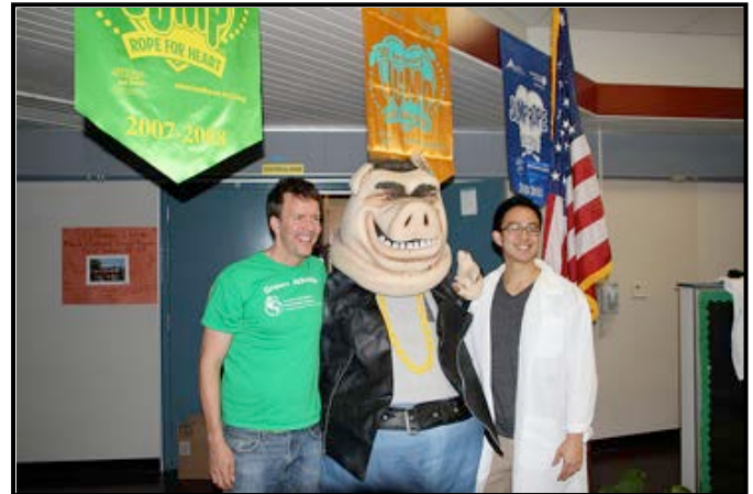
Rosa Parks Elementary hosted an Energy Hog assembly, which features a gnarly, energy-wasting hog (featured above) who gets scolded by a "hog buster" who teaches students about the important of energy efficiency.

Rosa Parks Elementary was one of many elementary schools that hosted an Energy Hog assembly. The assemblies, performed by PowerSave Local Project Leaders and PowerSave/Green Campus college interns, dramatize energy-wasting behaviors through the Alliance to Save Energy's Energy Hog character—a larger than life watt-swilling pig. Addressing the students as "Energy Hog Busters," the PowerSave staff taught kids to be on the lookout for "energy hogs," common energy-wasting behaviors that surround them every day, at home and at school. Students then cheered and jeered the appearance of actual Energy Hog, a five-foot incarnation of energy waste, and delighted in their new-found ability to ban the beast from their school.