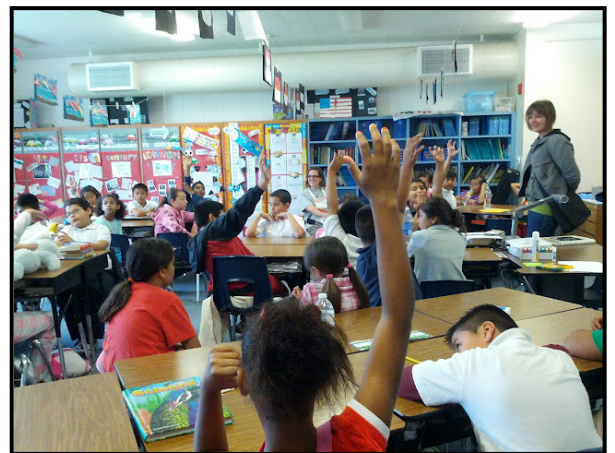
To educate students about green careers, Pomona Elementary's PowerSave Team invited the Assistant Manager from the local gardening store to not only discuss her path to a green career, but to give the students tips on their own school garden.