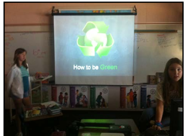
Norco Elementary's PowerSave Team shared their recommendations to save energy via a multimedia PowerPoint presentation.

Norco Elementary's PowerSave students created their own Powerpoint presentation to educate the rest of the student body about energy efficiency, and introduce them to the PowerSave program. The comprehensive presentation covered everything from the major sources of electrical power and their impacts on the environment, to the best ways to save energy at school and the particular policies the PowerSave team was spearheading. The students created slideshow themselves (based on information gathered from their Road Map Guide and from their own experience collecting data at their school), and presented to homeroom classes throughout the year.