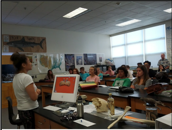
At Newport Harbor High School, Sole Technology's Environment Affairs Representative gave a guest presentation to discuss her career path and how she developed a passion for energy efficiency.

The Costa Mesa High School PowerSave Team hosted its first annual Green Career Fair welcoming 800 7 th -12 th grade students, and 500 students at the Green Career Panel! Featuring over 15 exhibits by local utilities companies, non-profit sustainability organizations, and local colleges and companies represented, the PowerSave team held a hugely successful event to introduce students to sustainability initiatives over the day-long affair. Students learned about solar heating, energy efficient bulbs, college preparatory courses, and utility practices to conserve and clean our water and reduce waste and energy consumption. The panel featured local businesses and a keynote from a UC Irvine professor. Due to the enormous success of the event, Costa Mesa High plans to host the event again next year.