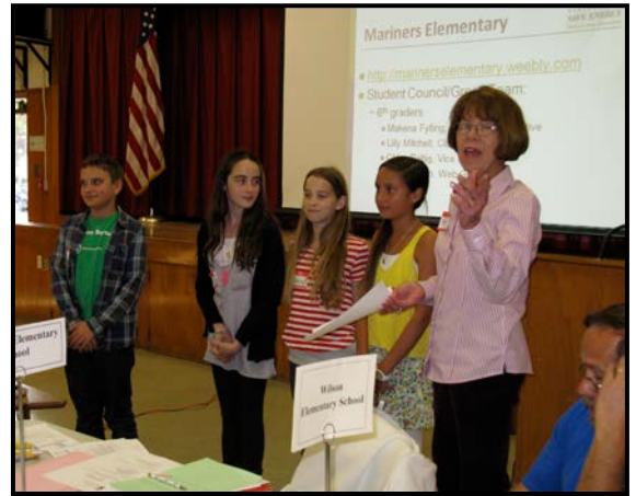
The PowerSave Team at Mariners Elementary School involved students by creating two "Energy Commissioner" roles in their student council.

To effectively launch their program, Temescal Valley teachers assigned a student WATT Killer in each classroom to monitor energy use on a daily basis. The WATT Killers turned off monitors, computers, and copiers and printers when they were not in use, closed the doors and windows when the air conditioner or heater was on, and encouraged each